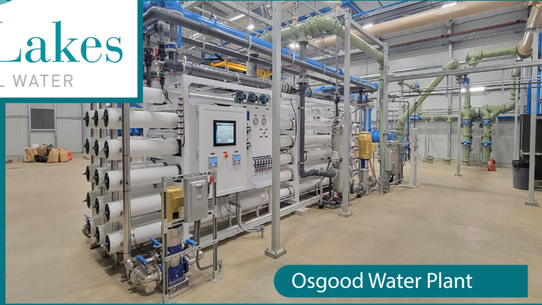
Osgood Water Plant