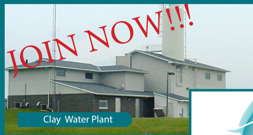
Clay Water Plant