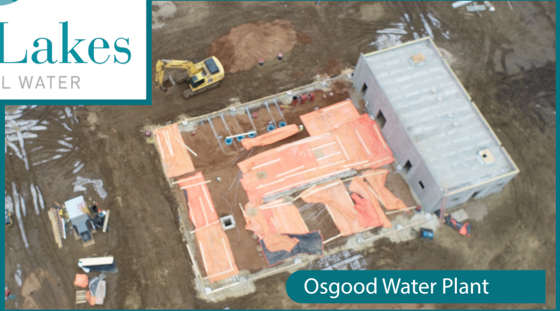
Osgood Water Plant